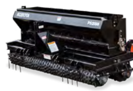
SEEDER 1.8m or 2.2m working width