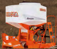
SH SEED BOX 200ltr - 500ltr