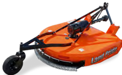
ROTARY CUTTER 1.2m - 3m working width