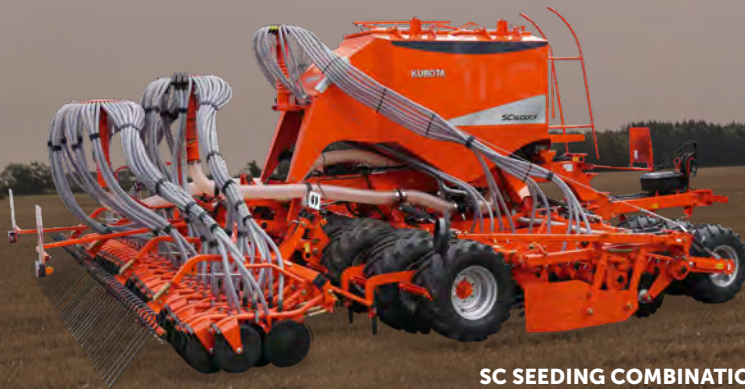
SC SEEDING COMBINATION 3m, 4m & 6m Working Widths