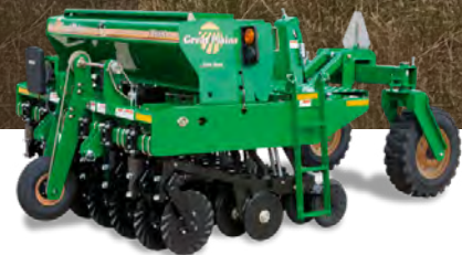
MOUNTED NO-TILL DRILL 1.7m to 2.9m working width