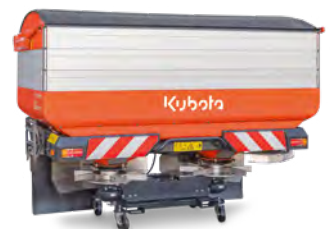
DS DISC SPREADERS 9m - 54m Spreading Widths