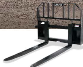
PALLET FORKS 48" (1.2m) Tine Length