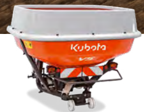
VS PENDULUM SPREADERS 0.75m - 15m Spreading Widths