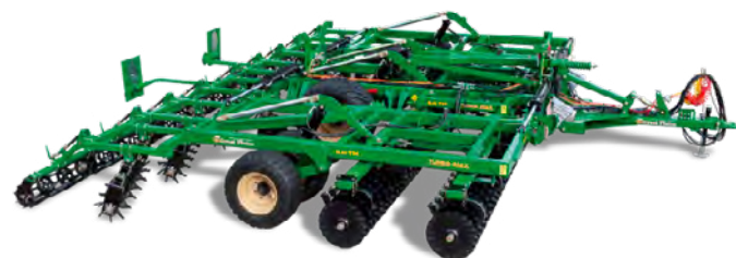
TURBOMAX DISC CULTIVATOR 3m to 12m working width