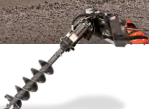
SKID AUGER 6" (15cm) to 24" (61cm) Augers