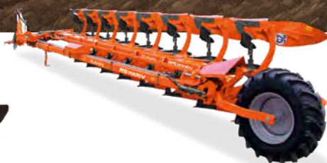
RM & RS PLOUGHS 3-8 Furrow Auto-Reset