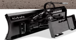
DOZER BLADE 2.1m cut with 6-way adjustment