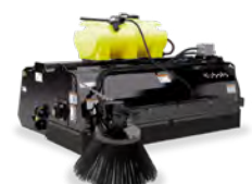
HOPPER BROOM 1.9m to 2.1m sweeping width