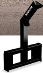
LOADER BROOM 2,722kg Rated Capacity