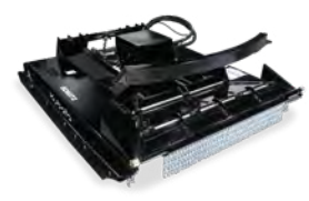
SKID CUTTER Standard, Heavy or Extreme Duty