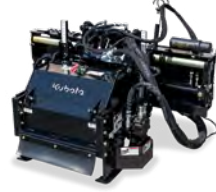
PROFILER Up to 1.2m working width