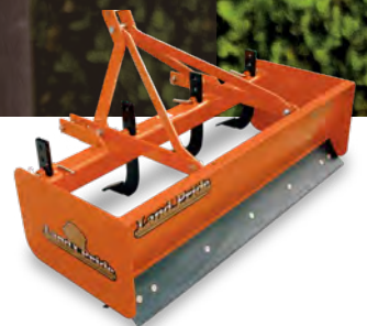
BOX SCRAPER 1.2m - 2.1m working width