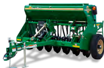
TRAILED MIN-TILL DRILL 2.4m to 4m working width