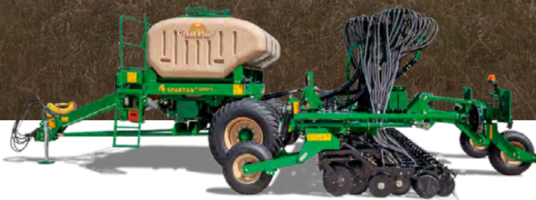
SPARTAN AIR DRILL 6m or 9m working width