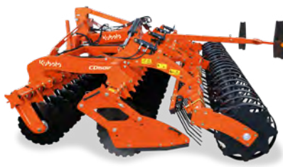
CD COMPACT DISCS 2.0m - 7.0m Working Widths