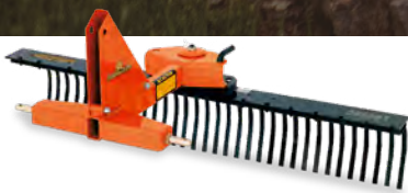
LANDSCAPE RAKE 1.2m - 2.4m working width