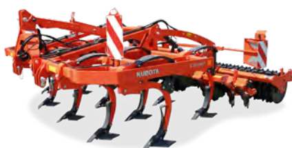
CU TINE CULTIVATORS 3.0m - 5.0m Working Widths