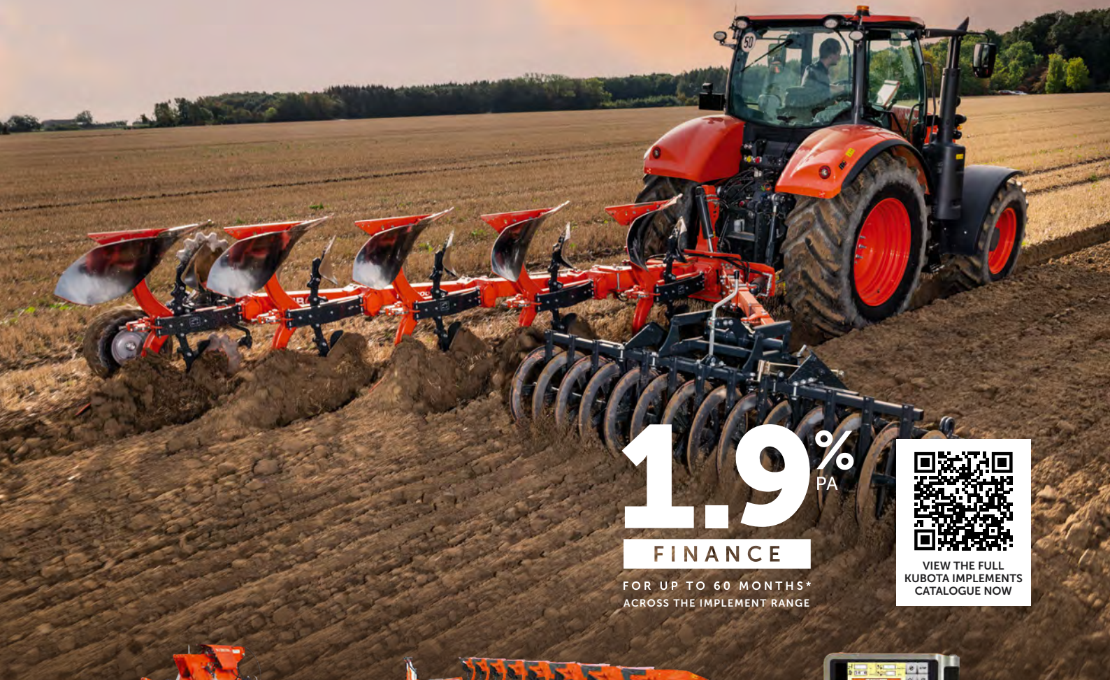
RM3005V 5 FURROW PLOUGH

When you're looking for an Implement you can rely on, look no further than the Kubota Implement range, we're right behind you.