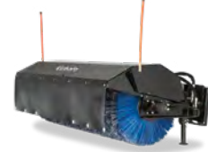
ANGLING BROOM Poly, Steel or Combination Brooms