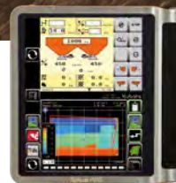
PRECISION FARMING TERMINALS Tellus GO+ 7" & Tellus PRO 12"