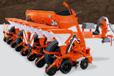
PP PRECISION PLANTERS 3.0m - 6.0m Working Widths