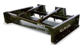
SKID GRADER 1.8m to 2.1m working width