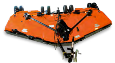
FOLDING ROTARY CUTTER 3.6m - 6.1m working width

^ BX & B Series offer: Receive $250 credit towards the purchase of Land Pride performance matched attachments for your new BX or B series tractor. Credit must be used at the time of purchasing the tractor. Choose from slashers, Seeders, Landscape Rakes, Rear Blades, Grading Scrapers, Box Scrapers, Quick Hitches, Mouldboard Ploughs, Post Hole Diggers, Disc Harrows, and Seed Bed Rollers. Offer expires 30/06/22 or while stock lasts. ^ L, MX & M Series offer: Receive $500 credit towards the purchase of Land Pride performance matched attachments for your new Kubota L, MX or M series tractor. Credit must be used at the time of purchasing the tractor. Choose from slashers, Seeders, Landscape Rakes, Rear Blades, Grading Scrapers, Box Scrapers, Quick Hitches, Mouldboard Ploughs, Post Hole Diggers, Disc Harrows, and Seed Bed Rollers. Offer expires 30/06/22 or while stock lasts.