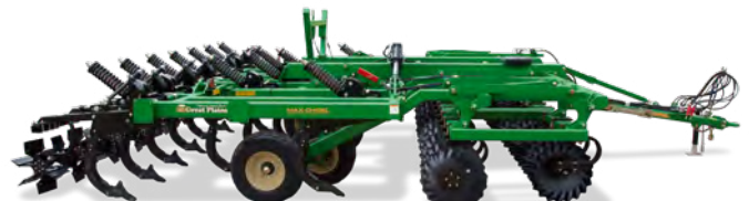
MAX CHISEL 3.5m to 7.3m working width