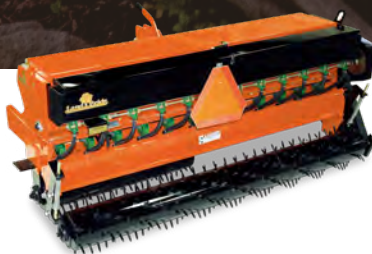
BROADCAST SEEDERS 1.3m - 2.2m seeding width