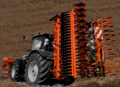
CB COULTERBAR 5.0m - 6.0m Working Widths