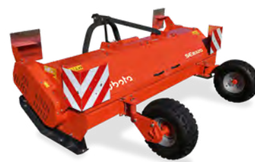
SE MULCHERS 1.5m - 4.0m Working Widths