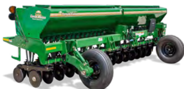
MIN-TILL DRILL 1.3m to 6.1m working width