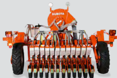
VP VEGETABLE PLANTERS 2.5m - 6.5m Working Widths