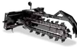
TRENCHER 1.2m to 1.5m trenching depth