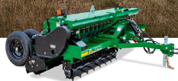
BROADCAST SEEDER 2.2m to 3.3m working width