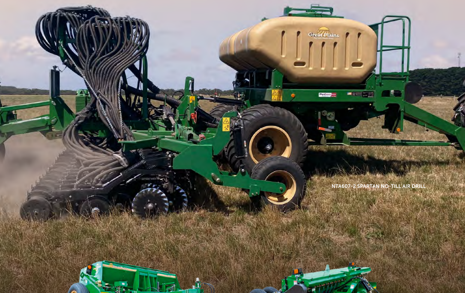
NTA607-2 SPARTAN NO-TILL AIR DRILL

VIEW THE FULL GREAT PLAINS RANGE CATALOGUE