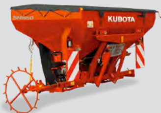
SH FRONT HOPPER 1,150ltr - 2,200ltr