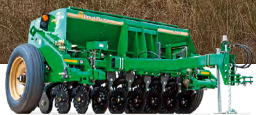
TRAILED NO TILL DRILL 1.7m to 6.1m working width