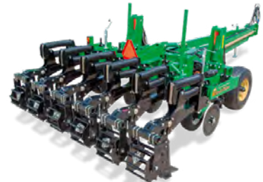
SUB SOILER 3m to 6.1m working width