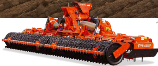
PH POWER HARROWS 2.5m - 6.0m Working Widths