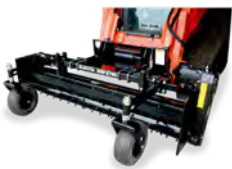
POWERED RAKE 1.8m to 2.3m working width