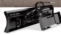
DOZER BLADE 2.1m cut with 6-way adjustment