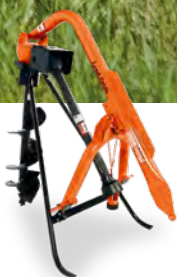
POST HOLE DIGGER Linkage or front end loader mount