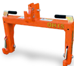
QUICK HITCH Cat 1 or Cat 2 hitch