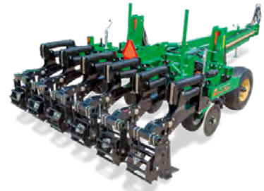
SUB SOILER 3m to 6.1m working width