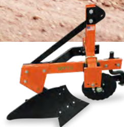
MOULDBOARD PLOUGH 1 or 2 furrow 20-60hp