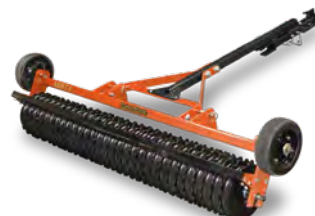
SEED BED ROLLER Linkage or trailed 1.8m working width