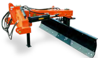
REAR BLADES 1.2m - 2.4m working width