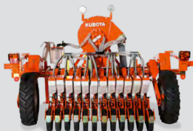
VP VEGETABLE PLANTERS 2.5m - 6.5m Working Widths