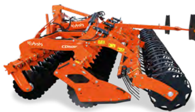
CD COMPACT DISCS 2.0m - 7.0m Working Widths