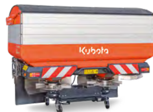
DS DISC SPREADERS 9m - 54m Spreading Widths