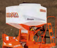
SH SEED BOX 200ltr - 500ltr