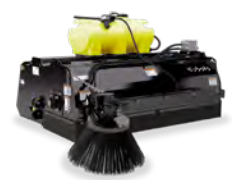
HOPPER BROOM 1.9m to 2.1m sweeping width