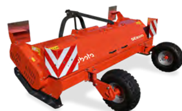
SE MULCHERS 1.5m - 4.0m Working Widths