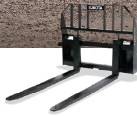
PALLET FORKS 48" (1.2m) Tine Length