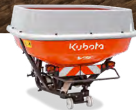
VS PENDULUM SPREADERS 0.75m - 15m Spreading Widths