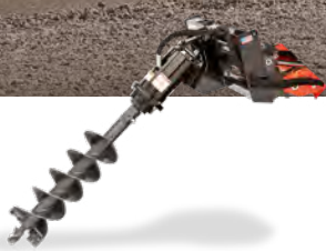
SKID AUGER 6" (15cm) to 24" (61cm) Augers