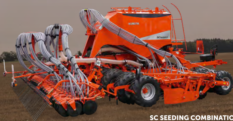
SC SEEDING COMBINATION 3m, 4m & 6m Working Widths