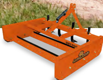
GRADING SCRAPER 1.2m to 2.4m working width