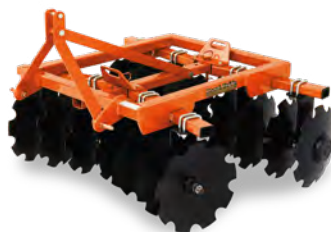
DISC HARROW 1.2m to 2.4m working width