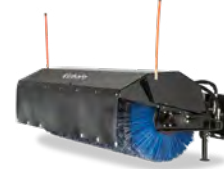
ANGLING BROOM Poly, Steel or Combination Brooms