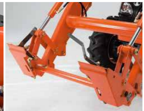
2-lever Quick Coupler